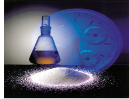
Synthetic drugs e.g. Aspirin