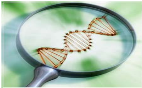
Genetic engineering Human insulin