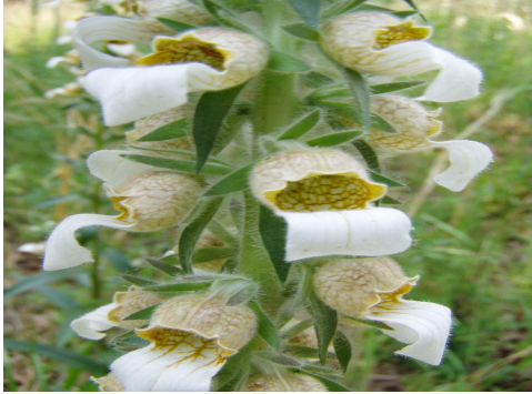
Plant sources e.g. Atropine